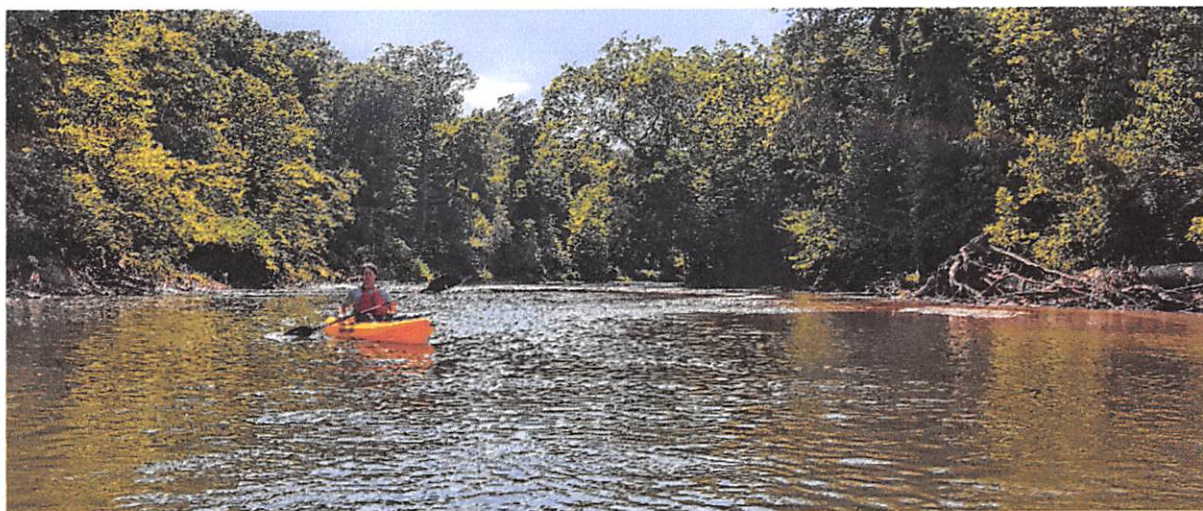
A paddler works his way down the Middle Fork of the Vermillion River in Illinois.